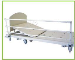
360HR Horizontal Side Rails