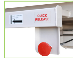
CPR Emergency Release