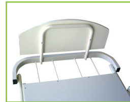
PO EXT Pull Out Extension (200mm)