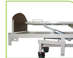
VSE Electric Vascular Support