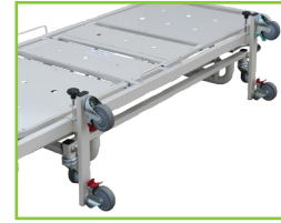
BMR Bed Mover Wheel Set