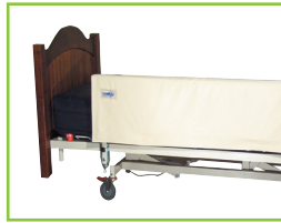
COT PRO Padded Side Rail Protectors