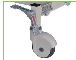
CLOK Central Locking Castors - Twin Wheel 125mm