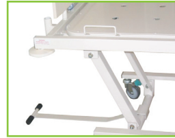
TBR7000 T Bar Buffer