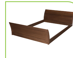
ADMIRAL Admiral Suite

*Most head and foot board styles are available in a range of colours on request.