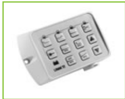
ACK Economy Attendant Control