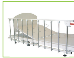
380VR-H High Deluxe Vertical Side Rails