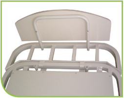
C.EXT1070-300 Clip On Extension (200mm)