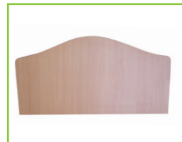
QAS Queen Ann Style