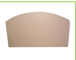
SCS Standard Curved Style