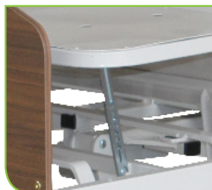
Adjustable Vascular Support