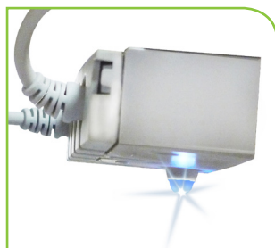
Underbed Lighting Feature