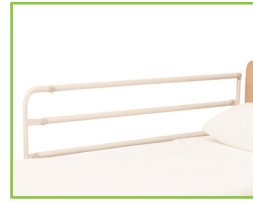
400HR Deluxe Horizontal Side Rails