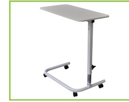
OBT Overbed Table