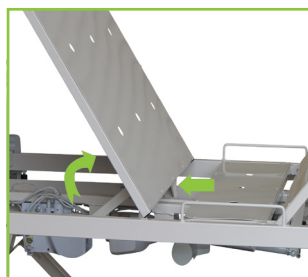
Auto Regression Backrest