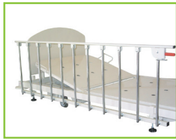
380VR Deluxe Vertical Side Rails