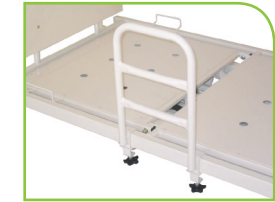
CLP400 Clamp On Support Rail 400mm