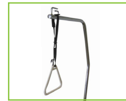
ASHP/H Self Help Pole