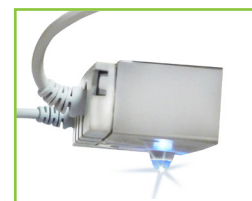
UBL Underbed Lighting