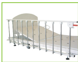
380VR Vertical Side Rails