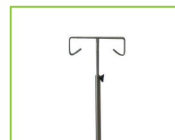
AIVP I.V. Pole