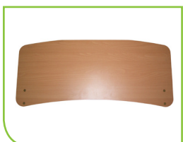
SAS Slender Arch Style