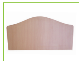
QAS Queen Ann Style