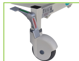
CLOK 125mm Central Locking Castors