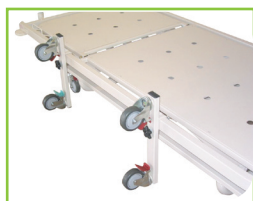
BMR Bed Mover Wheel Set