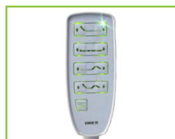
BLH Backlit Handset