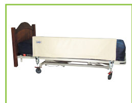
COT PRO Padded Side Rail Protectors