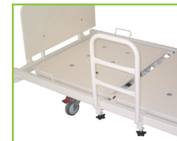
CLP400 Clamp On Support Rail 400mm