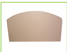
CS Curved Style