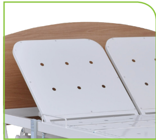
Individual Electric Backrest