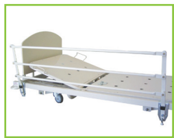
360HR Horizontal Side Rails