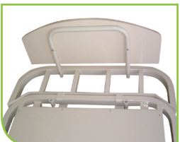
C.EXT 200mm Clip On Extension