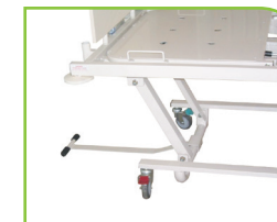
TBR2000 T Bar Buffer