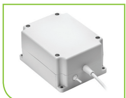
ABB Battery Backup