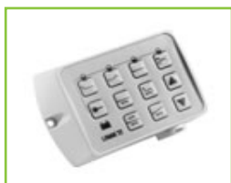
ACK Attendant Control