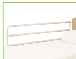
400HR Deluxe Rails