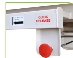
CPR Emergency Release