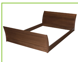
ADMIRAL Admiral Suite

* Most head and foot board styles are available in a range of colours on request.