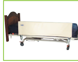
COT PRO Padded Side Rail Protectors

* Other colour head and foot boards are available on request, but we are unable to change the style.