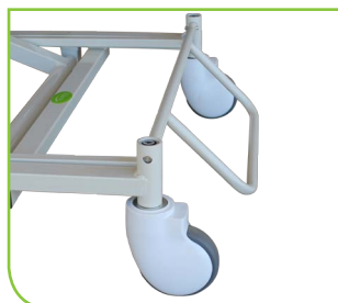
Central Locking Castors