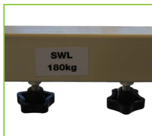
Weight Capacity 180Kg