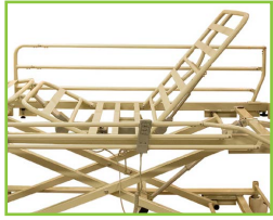
6001MPHR Horizontal Side Rails