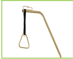
ASHP/6001IMP Self Help Pole