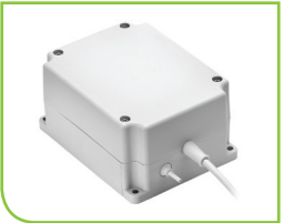
ABB Battery Backup