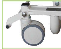
Twin Wheel Central Locking Castors