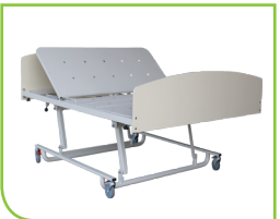
2300D Double Series