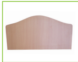
QAS Queen Ann Style