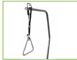
ASHP Self Help Pole