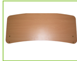
SAS Slender Arch Style