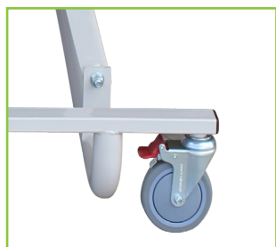
125mm Braking Castors