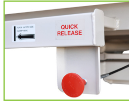
CPR Emergency Release