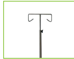
AIVP I.V. Pole