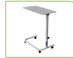
OBT OverBed Table