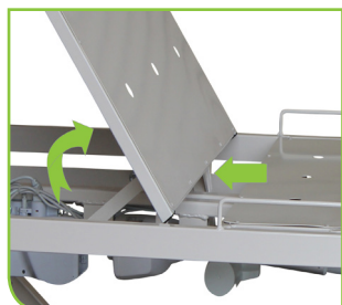
Auto Regression Backrest