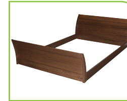
ADMIRAL Admiral Suite

* Most head and foot board styles are available in a range of colours on request.