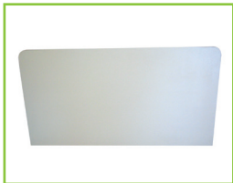
SS Square Style