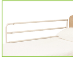
400HR Deluxe Rails