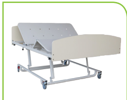
2300K King Series