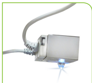
Underbed Lighting Feature