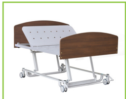
2300Q Queen Series