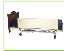
COT PRO Padded Side Rail Protectors