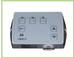
ACK Attendant Control