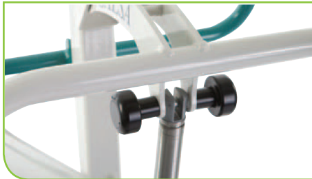
Knob Kit for Custom Sitting