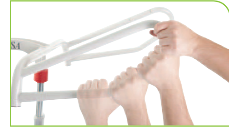
Multiple Grip Positions