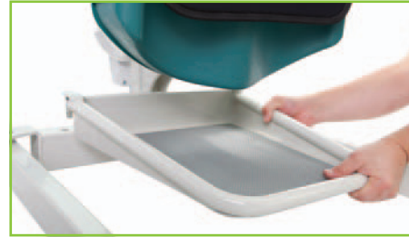
Sling Removable Footplate