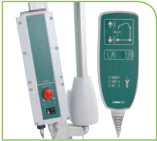
Linak Control System