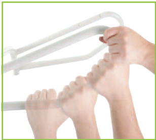
Multiple Grip Positions