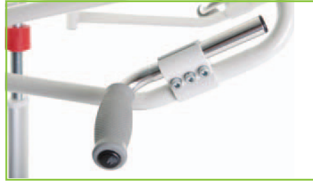
Tempo Handle Kit