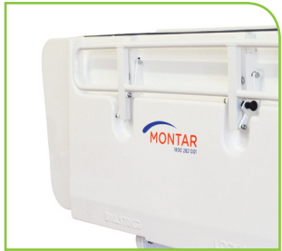
Folds up for space saving