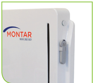
Remote Infa red handset